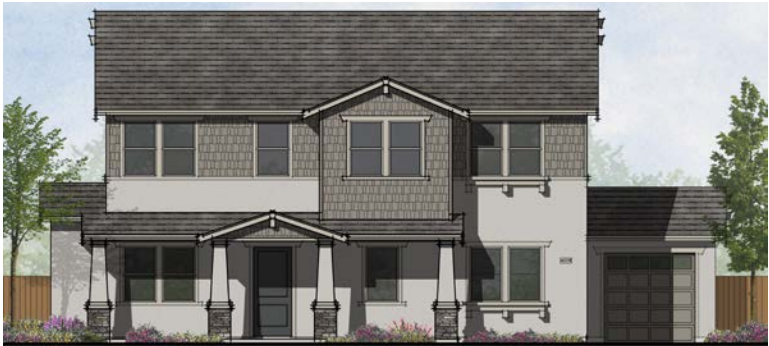
TRADITIONAL FRONT ELEVATION

Note: The Agrarian and Traditional Plan 2 elevations (Lots 1 and 8) have split, swing-in 3-car garages, while the Contemporary elevation features a front-facing 3-car garage and a larger Bedroom 5 closet configuration