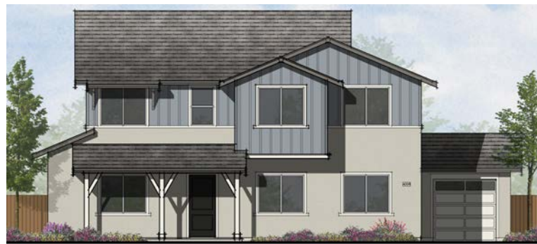
AGRARIAN FRONT ELEVATION